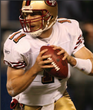
Alex Smith, QB Utah, '05 Round 1 Pick 1