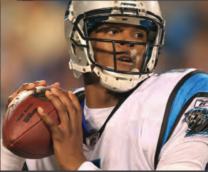
Eli Manning, QB