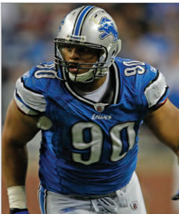
Ndamukong Suh, DL