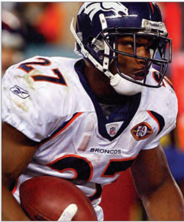
Knowshon Moreno, RB

Pittsburgh Steelers, 2x Super Bowl Champion