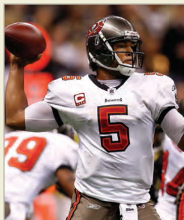
Josh Freeman, QB Kansas St., '09 Round 1 Pick 17