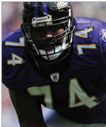
Michael Oher, OL