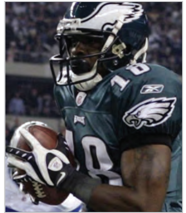
Jeremy Maclin, WR