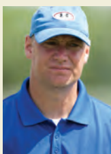
Heisman Trophy winner and current IMG Madden Football Academy

As the pioneer of the 360-degree approach to training, IPI's comprehensive programs are designed to improve the total athlete. By offering a completely customizable program, IPI's Combine Training provides full preparation for the NFL Combine and NFL Draft.