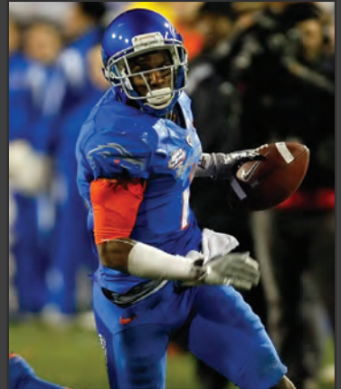
Titus Young, WR Boise State, Round 2 Pick 44

"The academy provided a comprehensive environment that helped me significantly in my Senior Bowl and Combine preparation. The training I received at the IMG Performance Institute not only prepared me physically for the NFL Combine, but gave me the confidence needed to be a top draft choice"