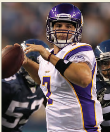
Christian Ponder, QB FSU, '11 Round 1 Pick 12

A test of endurance. From a three-point stance, the athlete runs 10 yards to one side, then back 20 yards and then 10 yards to the starting point.