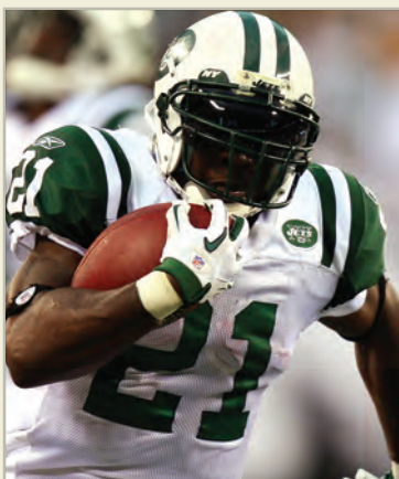
LaDainian Tomlinson, RB TCU, '01 Round 1 Pick 5